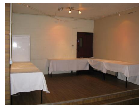
Wessex Suite Bar and Food Areas