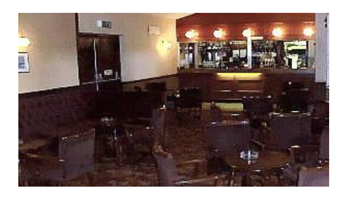
Elbrow Suite Bar and Seating Area

Hire Rate (Guide Price) : Friday Eve; £100, Saturday Eve £150 (Contact the office for more details or see website).