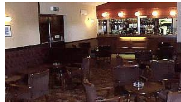
Elbow Suite Bar and Seating Area

Hire Rate (Guide Price): Friday Eve; £100, Saturday Eve £150 (Contact the office for more details or see website).