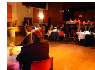
Various Functions and Events

See the Website for availability and Special Offers