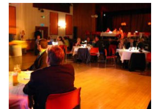
Various Functions and Events

See the Website for availability and Special Offers