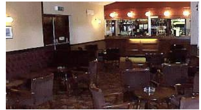
Elbow Suite Bar and Seating Area

Hire Rate (Guide Price): Friday Eve; £140, Saturday Eve £160 (Contact the office for more details or see website).